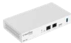
Nuclias Connect Hub